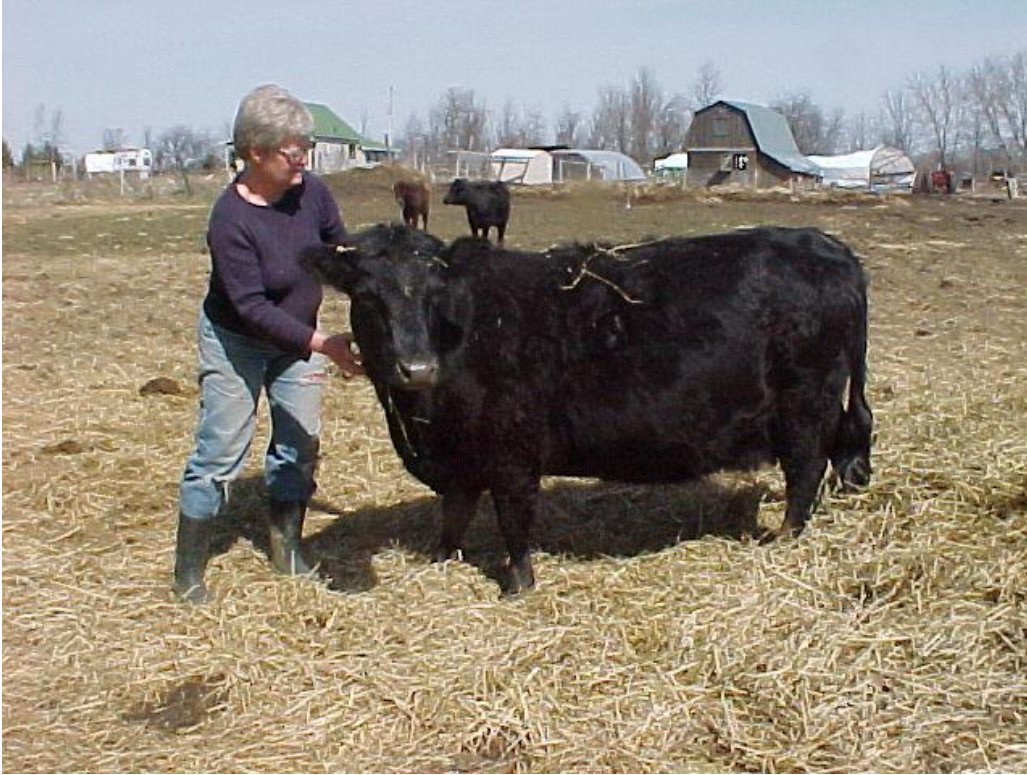
Photo of a bulldog calf, taken by Duncan McIntyre, Scottish Dexter breeder, 1977